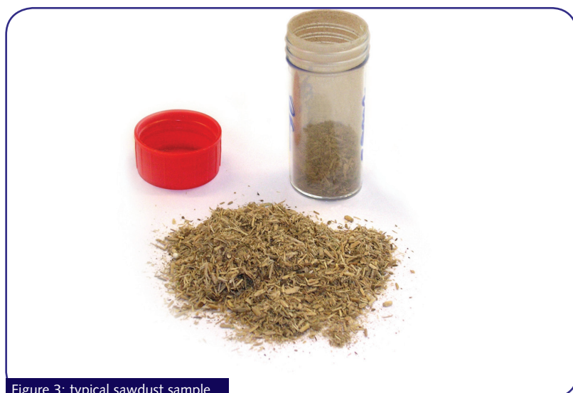
Figure 3: typical sawdust sample