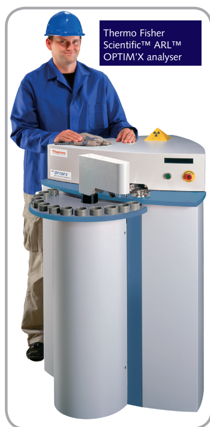
Thermo Fisher Scientific™ ARL™ OPTIM'X analyser

X-ray fluorescence (XRF) has been an essential part of the process and quality control of cement plants for more than 60 years thanks to its ease of use and fast response. After sample preparation consisting of grinding and pressing the material determination of CaO, SiO 2 , Al 2 O 3 , Fe 2 O 3 , MgO, SO 3 , K 2 O, Na 2 O, chlorine and fluorine among others is obtained within a few minutes in raw meal, clinker and cement.